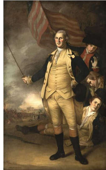
General Washington at the Battle of Princeton